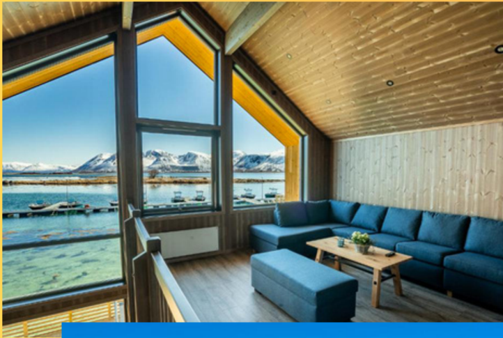
RISØYHAMN SJØHUS 3 nights